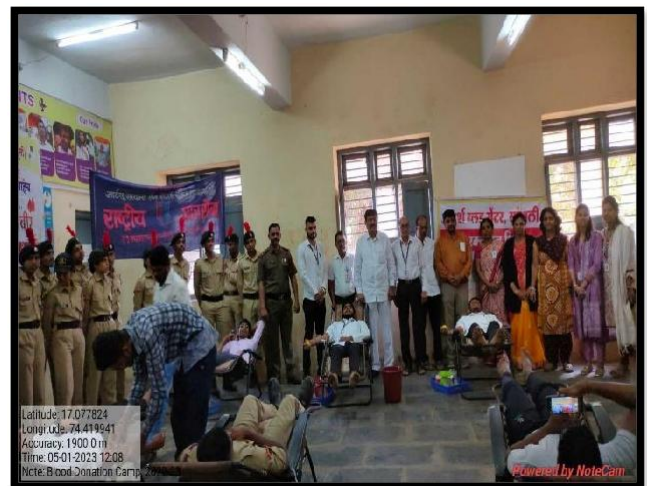
Teaching & non teaching staff at Blood Donation Drive.