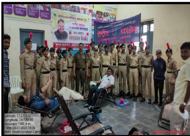
Teaching & Non- Teaching Staff donating blood. in the 'Blood Donation Drive'