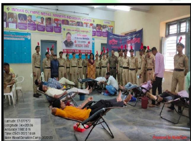
College students donated blood during 'Blood Donation Drive'.