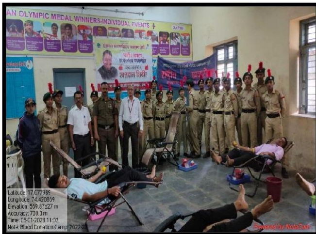
Hon. Principal, NCC Officer & NSS PO at Blood Donation Drive.