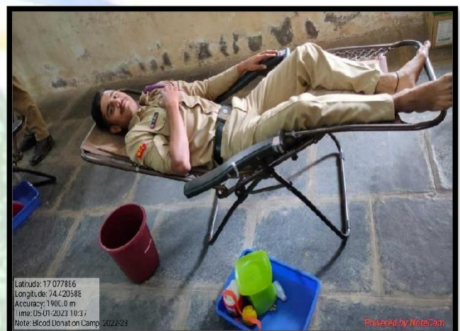
NCC Cadet donating blood at the drive.